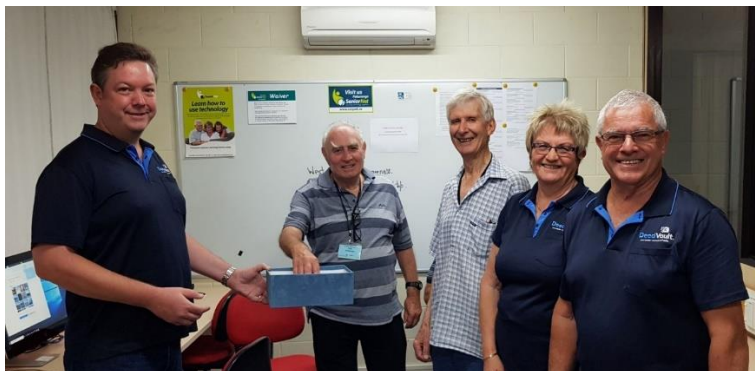
Figure 1 Members of DeedVault at Pakuranga SeniorNet

We thank DeedVault in partnering with SeniorNet in 2018 and look forward to ongoing mutual co-operation in 2019.