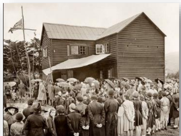
Size 660x 494 – a clear image