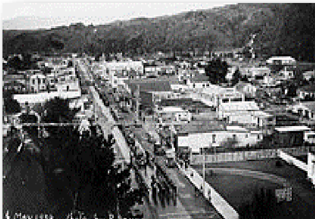
Size 220 x 131 – poor image